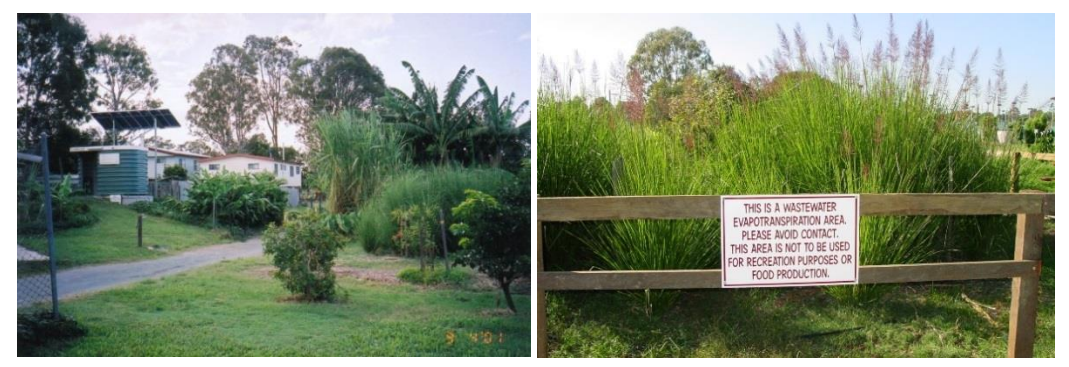
Vetiver planting to absorb effluent discharge from a toilet block in a park in Australia.

Groundwater monitoring of the vetiver cultivation (collected at 2 m depth) showed that after passing through 5 rows of vetiver, the levels of total N reduced by 99% (from 93 to 0.7 mg/L), total P by 85% (from 1.3 to 0.2 mg/L), and fecal coliforms by 95% (from 500 to 23 organisms/100 mL). These levels are well below the thresholds used by Australian Environmental Authority of total N < 10 mg/L; total P < 1 mg/L and E. coli < 100 organisms/100mL. (Figure 10).