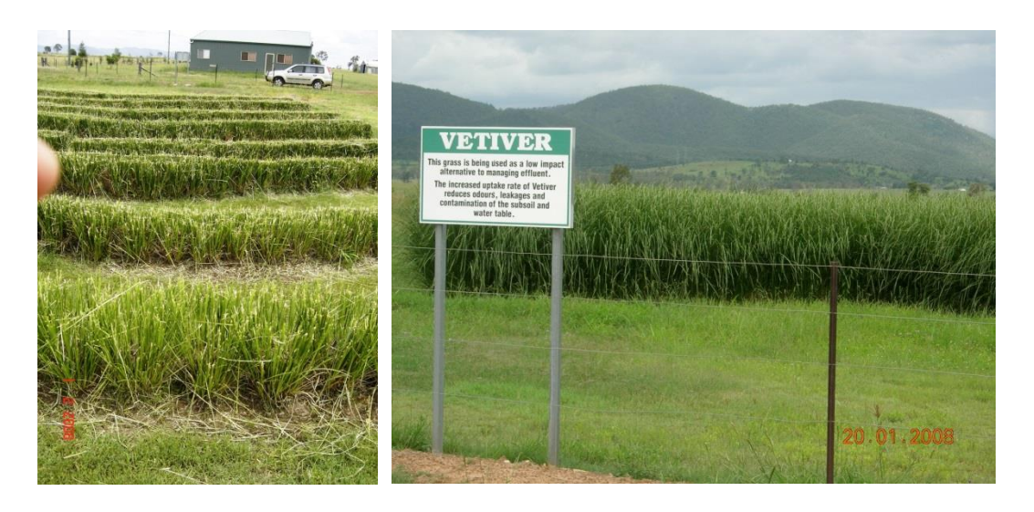
Sewage effluent disposal for small community in Australia.