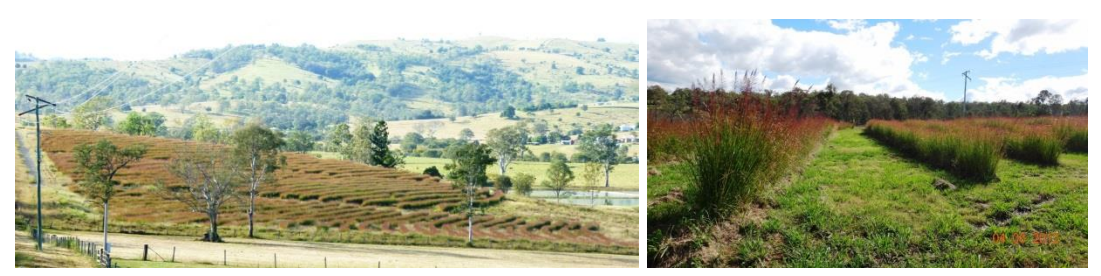
Municipal sewage effluent disposal for small town in Australia.