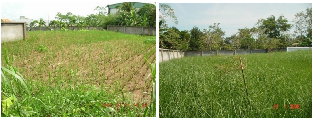
A seafood processing factory the Mekong Delta

In the Mekong Delta of Vietnam, a demonstration trial was set up at a seafood processing factory to determine the treatment time required to retain effluent in the vetiver field [Hydraulic Retention Time (HRT)] to reduce nitrate and phosphate concentrations in effluent to acceptable levels. The experiment started when plants were 7 months old. Water samples were taken for analysis at 24 hour interval for 3 days. Analytical results showed that total N content in wastewater was reduced by 88% and 91% after 48 and 72 hours of treatment, respectively. The total P was reduced by to 80% and 82% after 48 and 72 hours of treatment, respectively. The amount of total N and P removed in 48 and 72 hour treatments were not significantly different