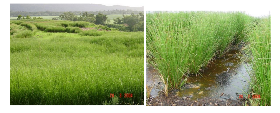
Municipal landfill leachate disposal for small town in Australia.

In Mexico, PASA, which is the largest solid waste management company in Mexico, currently applies VS for landfill leachate disposal, leachate seepage mitigation and for erosion control on landfill side slopes. The company has three projects underway, one each at Leon, Poza Rica, and Villahermosa. These projects have some 300,000 vetiver plants in the ground (Figure 18).