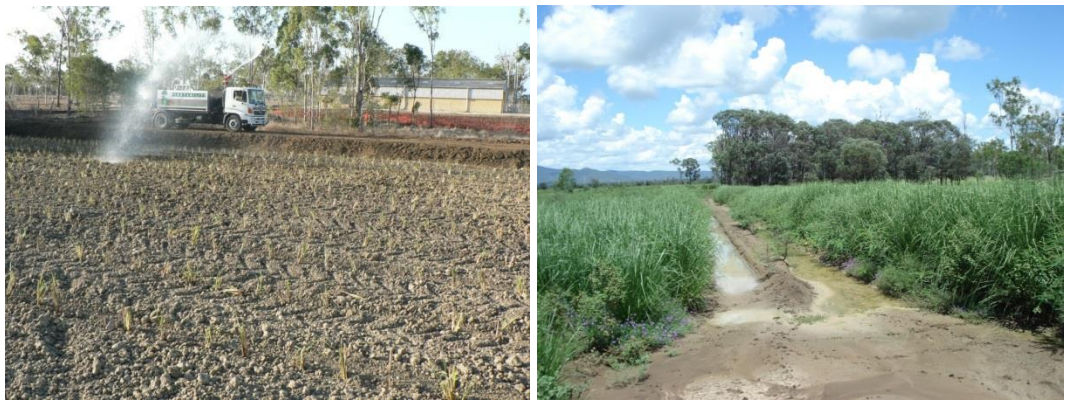
Extremely contaminated with high levels of Ammonia and Nitrate as a result of explosive manufacturing.

Based on the above average levels of NH3 and total N, the grand total N content of the top soil (20cm depth) is 0.66kgN/m<sup>2</sup>, which is equivalent to 6 600kgN /ha. Vetiver research has shown that Vetiver under optimum moisture supply can be grown on soil applied up to 8 000kgN/ha (Wagner et al 2003). Hence it is projected that most of the N in the fill will be removed by vetiver in less than 4 years under favourable weather and at most 6 years under normal weather conditions. One year after planting, the results were outstanding despite severe drought, excellent growth resumed following heavy rain six months later. With this high growth rate, this planting removed at least 629kg/ha/year, and possibly much higher, at 1100kg/ha depending on the rain, indicating that this projection is on course.